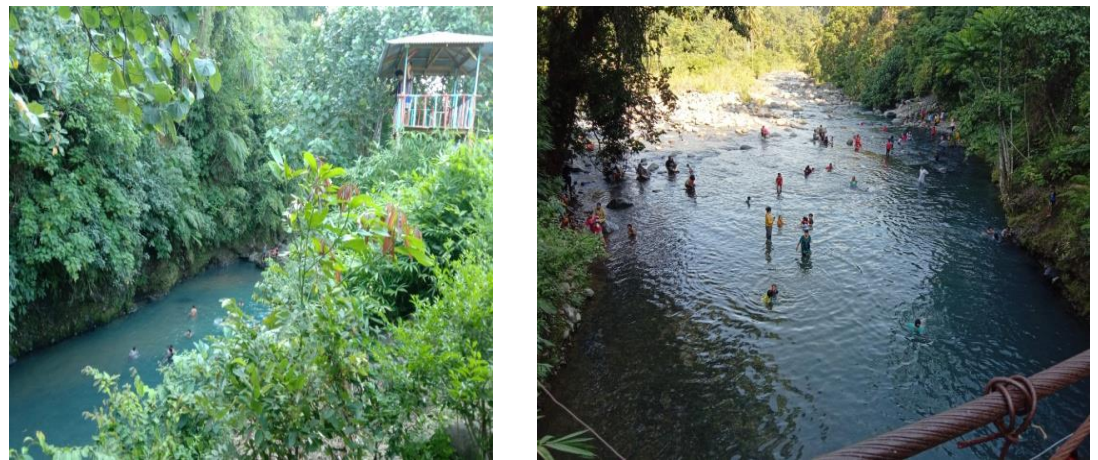
Figure 1. Lubuak Mande Rubiah tourism products

Thus there must be human connectivity in marketing so as to produce effective and efficient marketing. Through this human-to-human connectivity, the role of pentahelix actors is needed in doing this marketing. Each pentahelix actor is expected to be able to optimally market the Lubuak Mande Rubiah destination through the use of a predetermined website. Collaboration between pentahelix actors in carrying out promotions is expected to be able to attract potential tourists (customers) to visit the Lubuak Mande Rubiah destination.